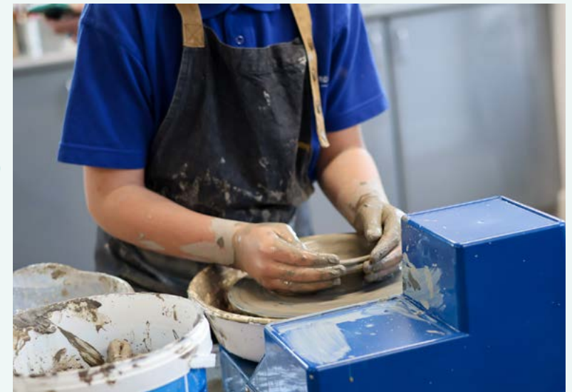
Pottery Throwing Taster

Be inspired by our exhibitions, learn about some of the artists and their work, and explore new craft activities to create some amazing art of your own. Share what you have created to achieve your 'Discover' Arts Award Certificate. £20, 5–11yrs