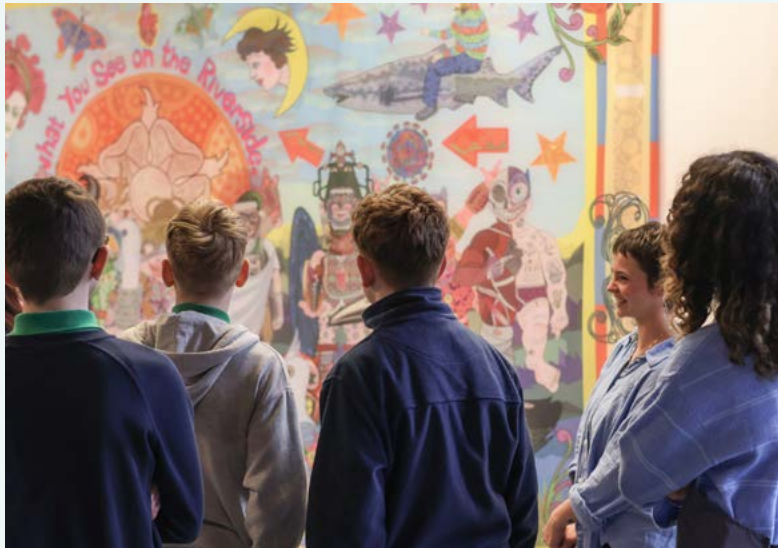
School Exhibition Visit

To visit or book a workshop at the Hub or your educational setting call 01529 308710 or email visualarts@hub-sleaford.org.uk or dance@hub-sleaford.org.uk