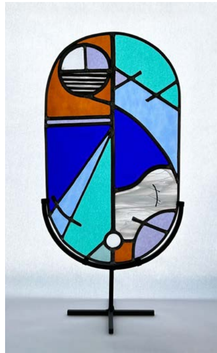
Images Top: Hot Masks II , 2008. Kevin Wallhead Bottom: Cricket by the Sett , 2025. Jo Turner